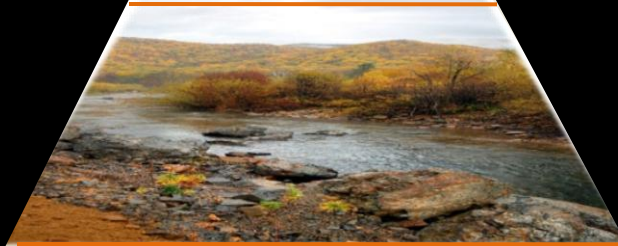
Vast, widely variable habitats